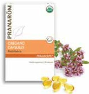
OREGANO CAPSULES Resistance

Other Ingredients: Non GMO Canola oil*, marine gelatin*, glycerin, d-alpha tocopherol * Certified Organic