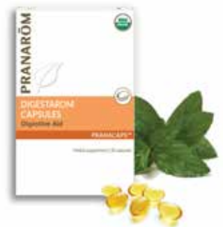
DIGESTAROM CAPSULES Digestive Aid

Other Ingredients: Non GMO Canola oil*, marine gelatin*, glycerin, d-alpha tocopherol * Certified Organic