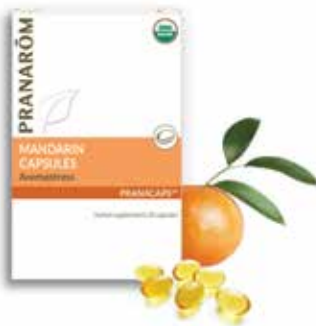
MANDARIN CAPSULES Aromastress