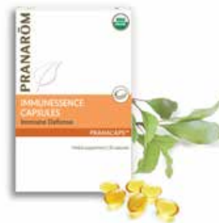
IMMUNESSENCE CAPSULES Immune Defense

Naturally contains: 44% carvacrol 19% thymol